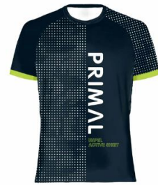
Impel Active Shirt