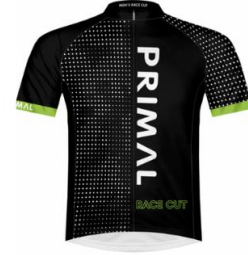
Sport Cut Jersey